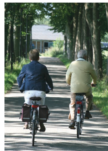
magnetic resonance imaging (MRI) of the brain to scan for

Previous studies have shown that physical inactivity is one of the risk factors for ischemic stroke—in other words the type of stroke that results from restriction of blood supply to the brain and then may lead to brain function damage (American Heart Association; http://www.americanheart.org/presenter.jhtml?identifier=4716 ). Among the African-American members in ARIC, physical activity related to mild sports was found to lower the odds of having an area in the brain blocked from its blood supply. This was studied using